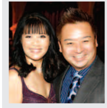
Pictured, L - R: Melissa Joan Hart and John Salley; Benito Martinez, Shawn Ryan, Cathy Cahlin Ryan and CCH Pounder; Paula Abdul and Kelly Stone; Suzanne Whang and Rex Lee